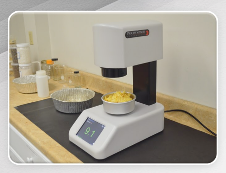
Low fat potato chips