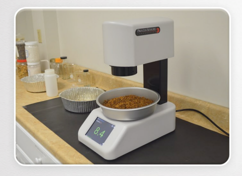
Moisture in tobacco